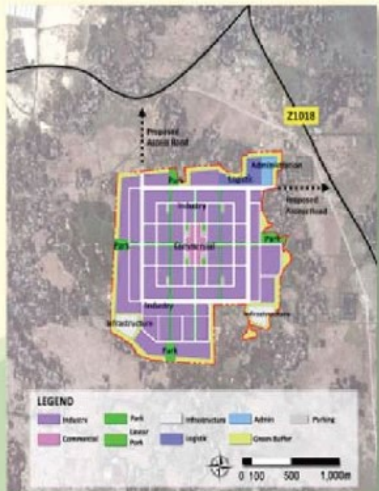
Land Use Plan