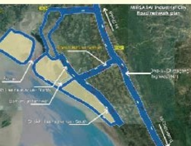
Road Network Plan