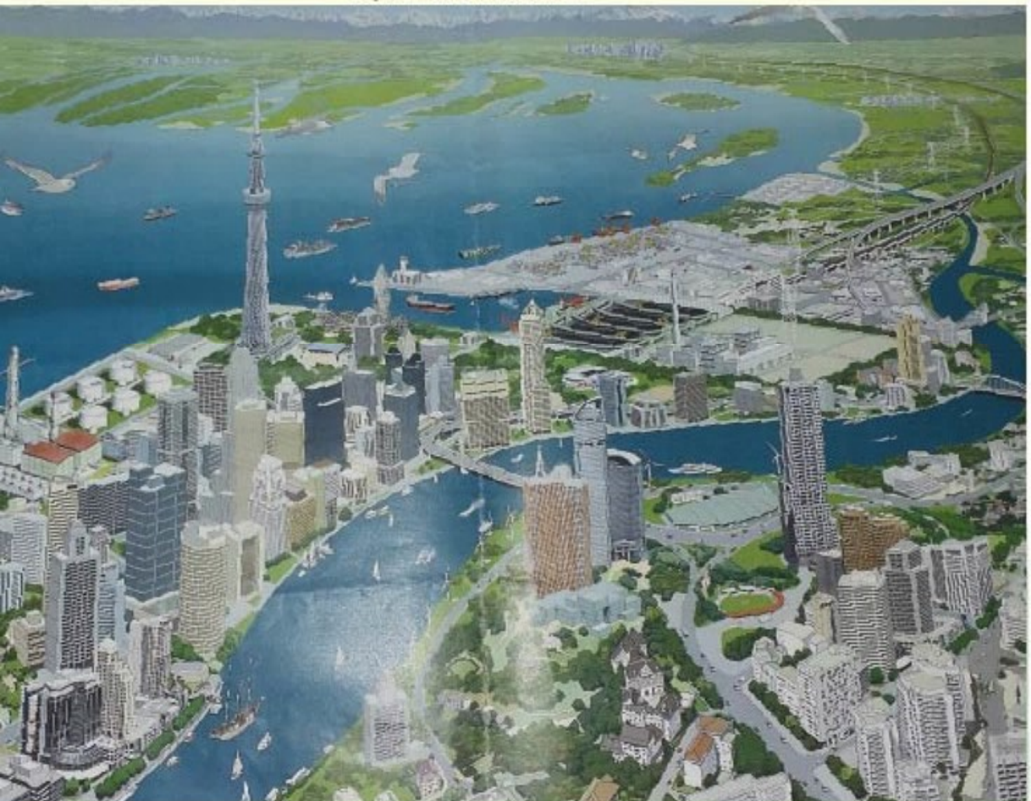
Layout Plan of Moheshkhali