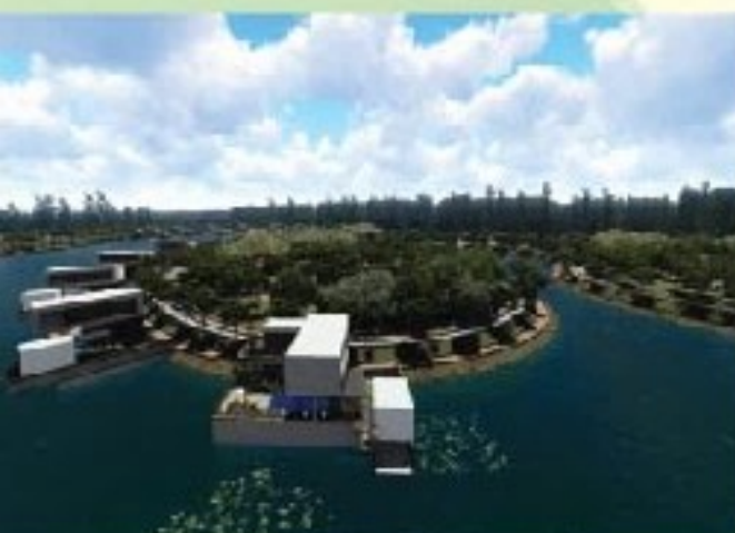
Sheikh Hasina Lake (Tourism site)