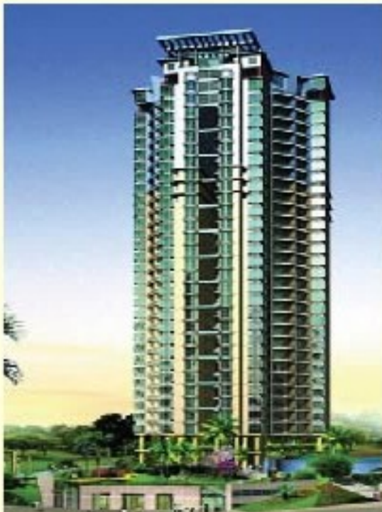
CIEZ Administrative Building

Chinese Industrial and Economic Zone will be the first specialized G2G economic zone, with an existing area of 783 acres. It has the potential to meet all the necessary conditions to become a successful Economic Zone. Once the economic zone is established, it is expected that there will be a huge demand for industrial plots from potential investors of China. China Harbor Engineering Company Ltd. has been appointed by China Government to develop the zone and they have already started the construction of access roads.