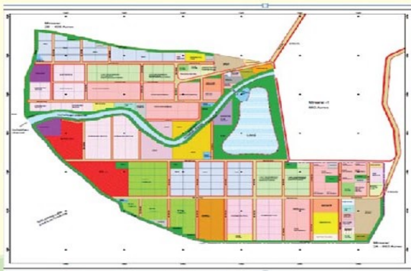
Master Plan of Mirsarai-2

The Mirsarai EZ-2 site is located beside the Mirsarai EZ (Phase-I). The total area of the site is 1300 acres. BEZA has already completed all requisite studies, viz. Feasibility Study, Environmental and Social Impact Assessments.